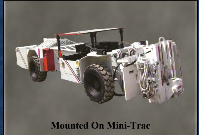
Mounted On Mini-Trac